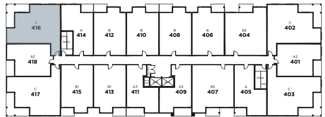
FOURTH FLOOR ▲